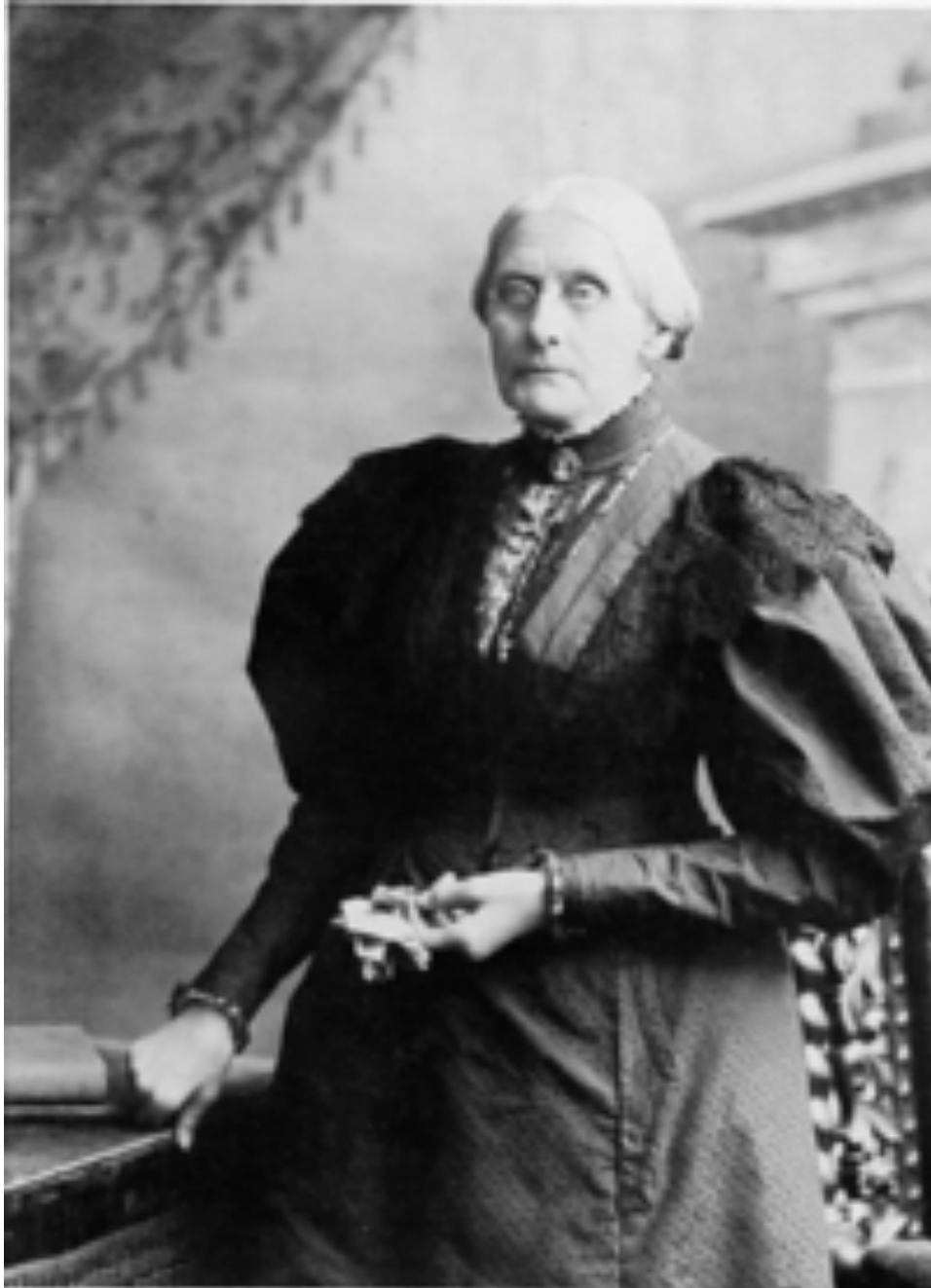
Image of Susan B. Anthony